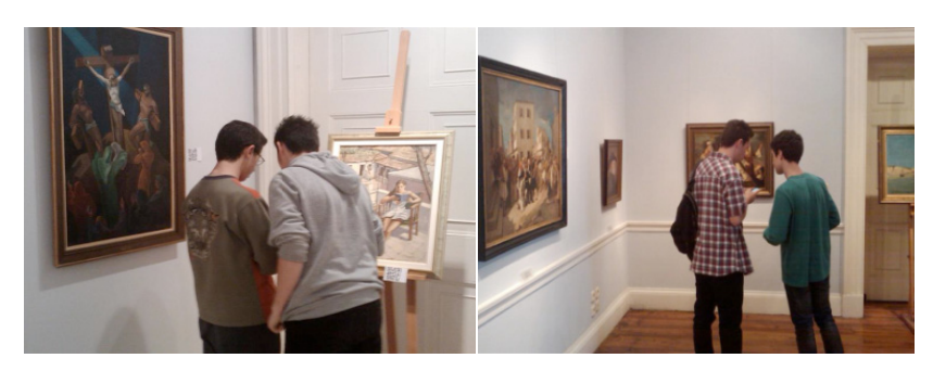
Fig. 3. Students of the mobile-based game were immersed in questions displayed on their mobile phones

The results highlight that the enrolment with the mobile affects their performance. However, both (paper-mobile) games persuade the children in several ways. A team benefits from a strategy and game characteristics seem to motivate and excite them for the activity. In addition, based on the observations of the researcher students seemed to be more focused and immersed on the mobile application (fig. 3). Interestingly, mobile application did not push students to lose their interest for the museum as many paintings and its features are discussed from students by the end of the experiment and on the respective course on school. Another notable observation is that students from both groups spent approximately the same total time at the gallery (19 min on average). This may be derived from students' familiarity with mobile phones and the simple design of the game.