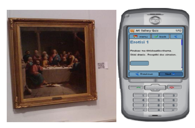
Fig. 2. The QR codes were placed next to the paintings (left), the mobile application (right)