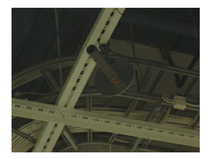
Fig. 2. The pseudolite antenna attached to the ceiling of the Exhibition Hall 2

The test results showed that the pseudolite system is capable of providing very good positioning accuracies in an indoor environment. In the beginning of the project, it was estimated that an accuracy of 1 meter would serve the needs of an exhibition application. During the tests, we showed that sub-meter, and even sub-decimetre, accuracies can be acquired using the pseudolites. Specifically, the achieved positioning DRMS (distance root mean square) for 2-dimensional positioning (x, y) was 0.06m and 0.24m for 3-dimensional positioning (x, y, z). Although the current system is not feasible for real exhibitions due to the inconvenient size of the end-user receiver, discussions with receiver manufacturers revealed that small and efficient receivers should be available by early 2005.